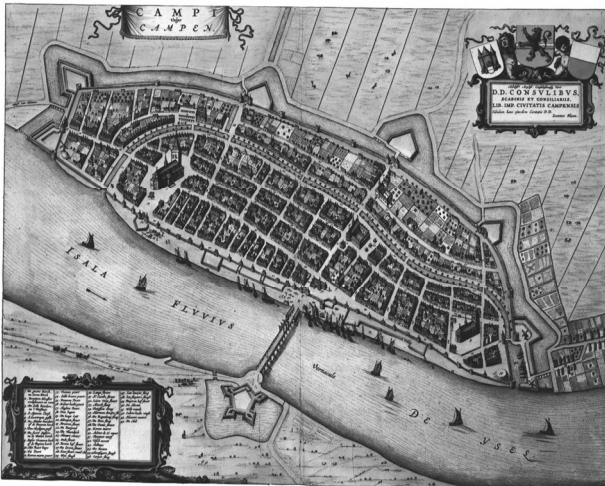
Figure 1: Historical map of Kampen (Blaeu 1652)

walls. A nice illustration of a bulwarked city is the historical map of Kampen (Figure 1).