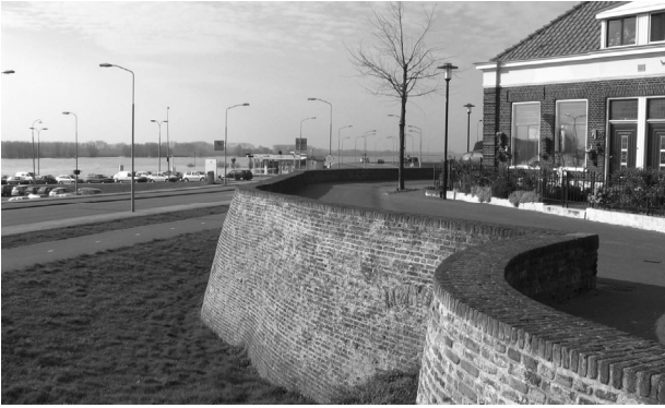
Figure 3: Current flood defence in Tiel.

dunes. The river course contributed to a positive living climate. In return urban developments created conditions and opportunities for flood protection of these cities.